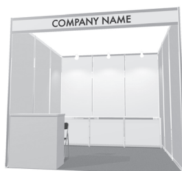
Standard Plan A ( 1 booth type )

*Please contact the Secretariat for more details